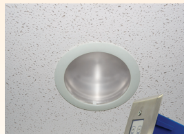
ETS-Lindgren ZXR LED Down Light & Dimmer Switch

ETS-Lindgren's Med-Vizion ZXR Down Light is a maintenance-free lighting system rated for 80,000 hours of usage. It offers simple installation with plug-and-play connections. Most importantly, compared to traditional incandescent lighting, the environmentally conscious