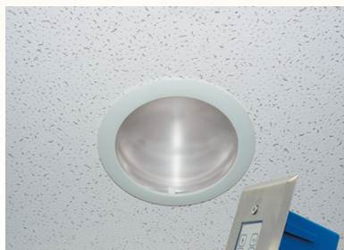
ETS-Lindgren ZXR LED Down Light & Dimmer Switch

ETS-Lindgren's Med-Vizion ZXR Down Light is a maintenance-free lighting system rated for 80,000 hours of usage. It offers simple installation with plug-and-play connections. Most importantly, compared to traditional incandescent lighting, the environmentally conscious Med-Vizion lighting offers brighter images with reduced energy consumption, resulting in lower energy bills over time. The optional dimmer switch features a low-voltage plug-and-play interface. One dimmer switch will support up to 16 ZXR Down Light fixtures.