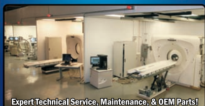
Expert Technical Service, Maintenance, & OEM Parts!